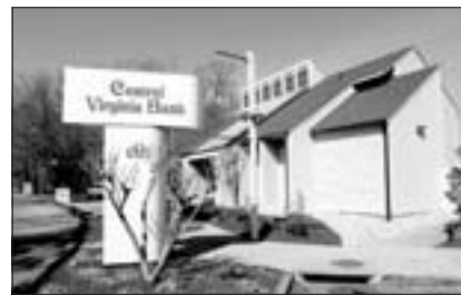
Brandermill 4901 Millridge Parkway

Finding one bank to handle all the needs of our family was very hard. We needed ID theft protection, check writing, debit cards, credit cards, phone banking, great customer service, monthly statements, text messaging to notify us of over drafts on any account, auto bill pay, online banking and we wanted it all free. We also wanted a bank that got to know us. And most importantly teach all of us how to use online banking. Many banks offered some of these items but none had all of these features and the great service we found at CVB. Plus they always seemed to be open when we needed to visit the branch. CVB made banking easy by serving all of our unique family needs. And it is all FREE.