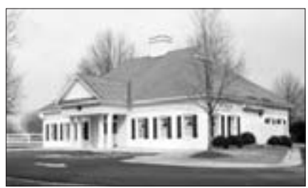
Bellgrade 2500 Promenade Parkway