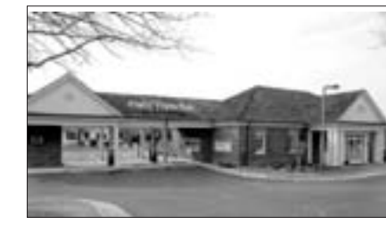
Midlothian 13200 Midlothian Turnpike