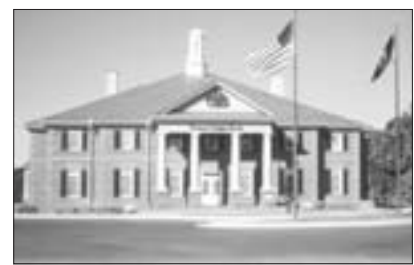
Powhatan 2351 Anderson Highway