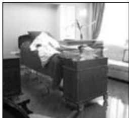
St. Francis Medical Center Birthing Suite