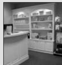
A Woman's Place Lactation Center